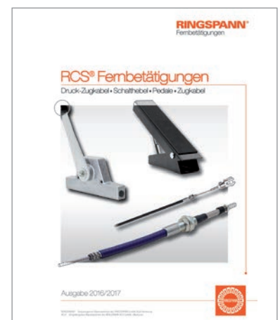
The current 2016/2017 complete catalogue of RINGSPANN RCS provides detailed information on the many different executions and delivery forms of the remote control systems as well as the large range of specially-adapted accessories